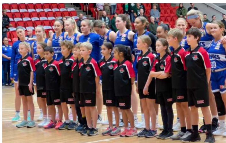
CBBC Guard of Honour for the Perry Lakes Hawks Women.