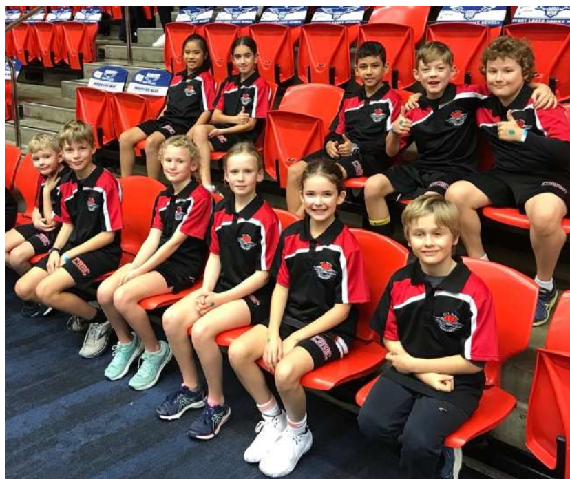
CBBC boys and girls in their new polo shirts for the Women's Guard of Honour.