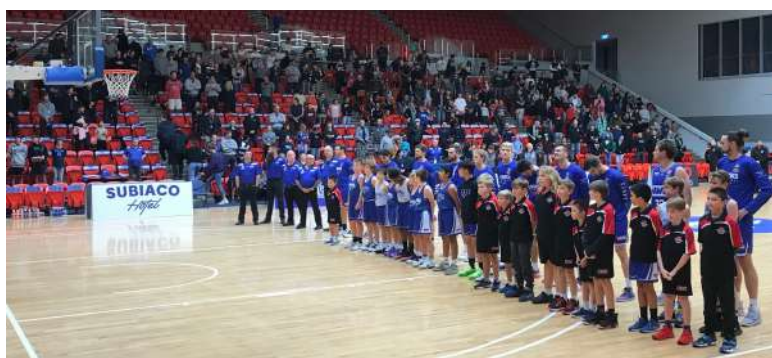
CBBC Guard of Honour for the Perry Lakes Hawks Men.